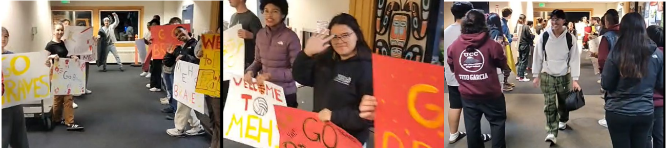
Orientation Leaders welcome new students with signs and cheers as they arrive on the Alaska Airlines charter