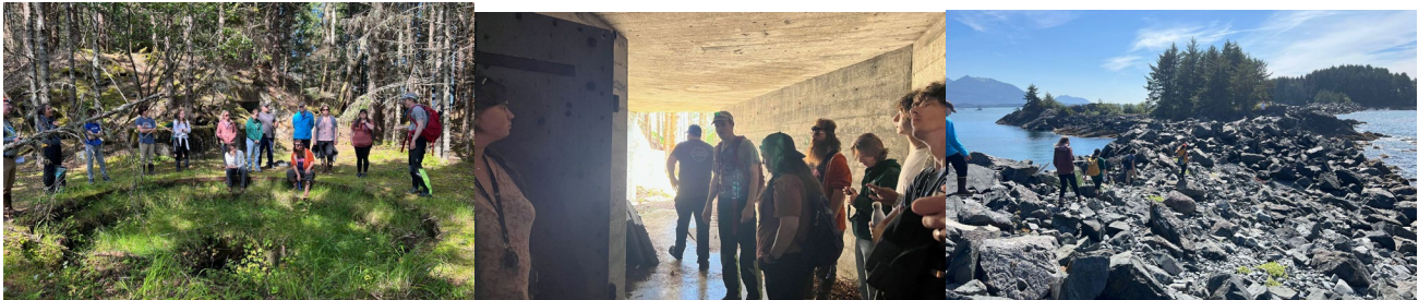
Staff gets historical tour of World War II bunkers from a teacher during fall in-service, connecting it to our campus history