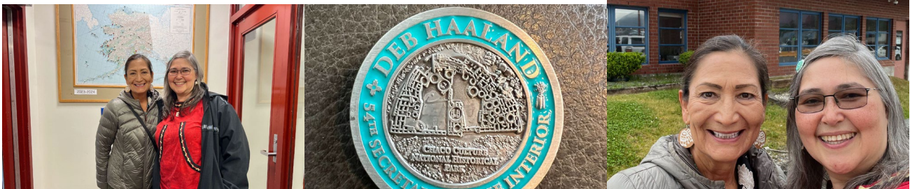
Department of Interior Secretary Deb Haaland, Federal Indian Boarding Schools Initiative, visited MEHS on July 21